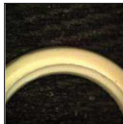
Incumbent FFKM Top Nozzle Seal