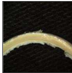
Incumbent FFKM Poppet Seal