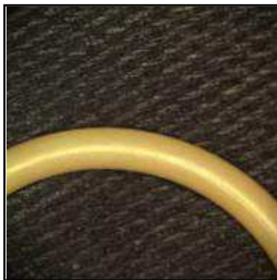
Kalrez® 9100 Poppet Seal

Figure 2. DuPont™ Kalrez® 9100 and incumbent seals after processing 5000 wafers. It was the research center's opinion that the Kalrez® 9100 seals could have continued to function beyond the scheduled PM cycle of 5,000 wafers.