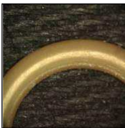
Kalrez® 9100 Top Nozzle Seal